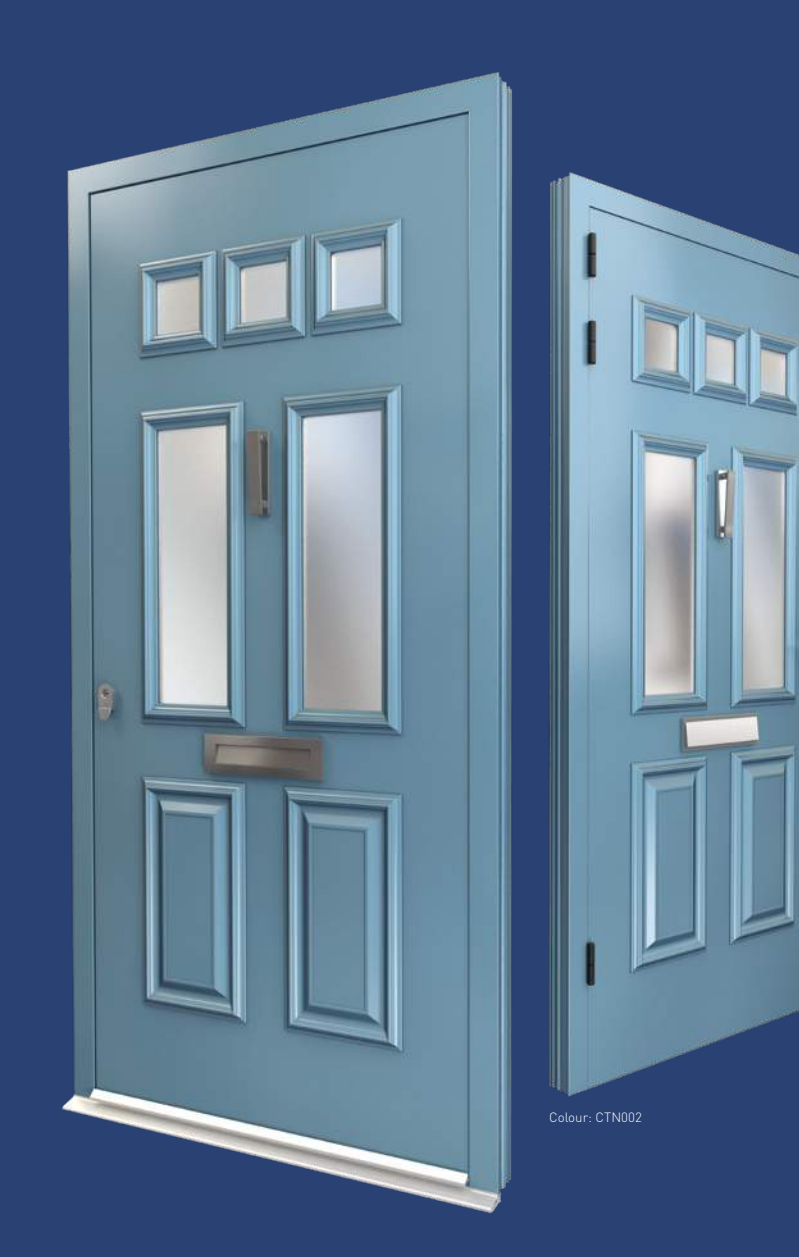
Industry leaders in product innovation, design and technical expertise